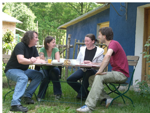
The Hamburg Research Group in Wendelstorf (May 2008)