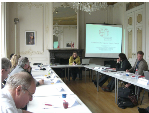
Trade monitoring workshop in Brussels (April 2008)