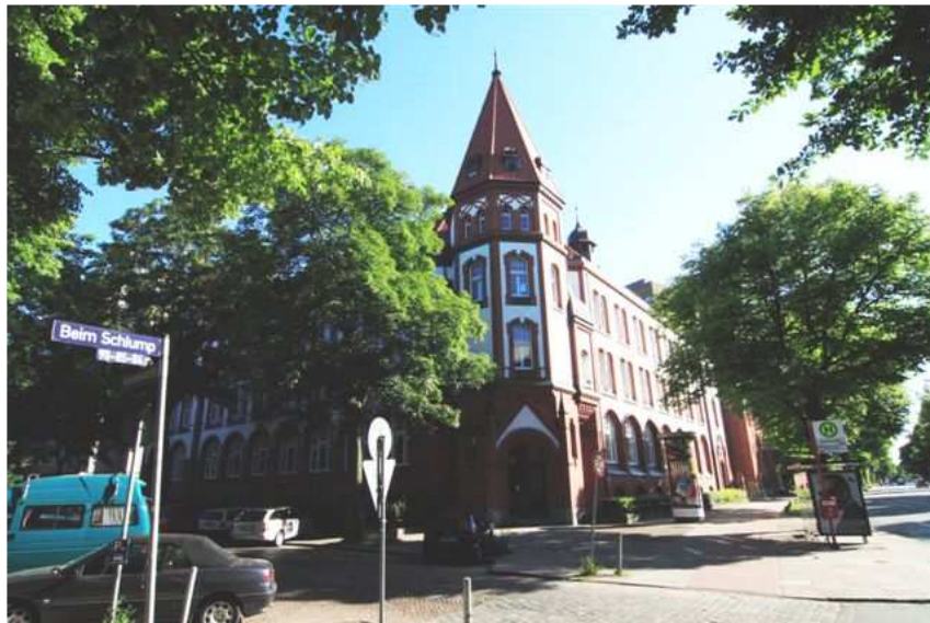
The Research Group's new home on Beim Schlump.